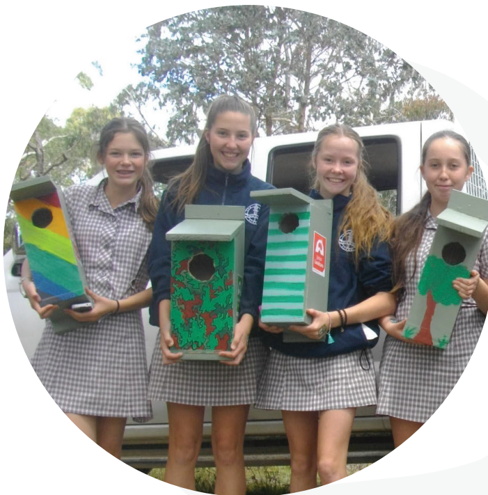
Yea High School students helping to put up nest boxes.