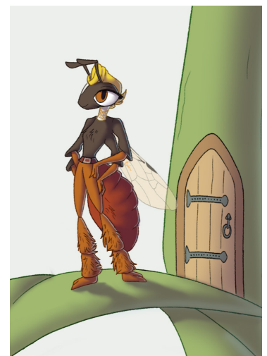
IMAGES: Rita the Reed Bee, the Australian Pollinator Week mascot